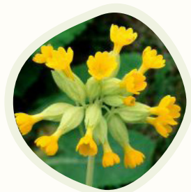
Cowslip ( Primula veris )