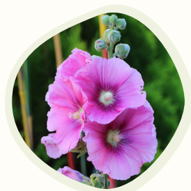
Hollyhock ( Alcea rosea )