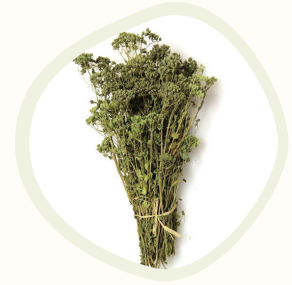
Oregano ( Origanum heracleoticum )