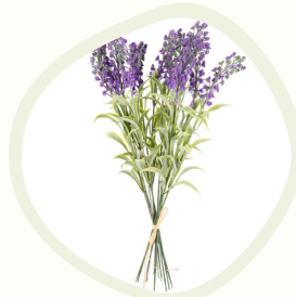
Lavender ( Lavandula angustifolia )