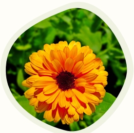
Marigold ( Calendula officinalis )