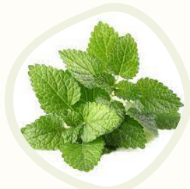
Lemon Balm ( Melissa officinalis )