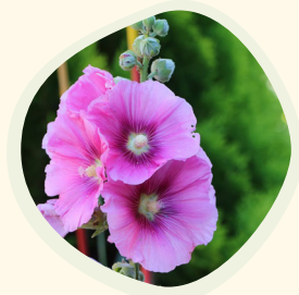
Hollyhock ( Alcea rosea )