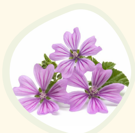
Mallow ( Malva sylvestris )