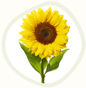
Sunflower ( Helianthus annuus )