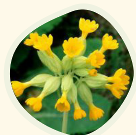
Cowslip ( Primula veris )