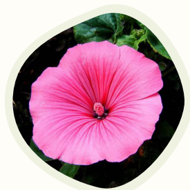
Mallow Rosa ( Malva rosea )