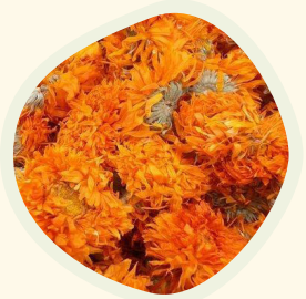
Marigold ( Calendula officinalis )