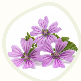
Mallow ( Malva sylvestris )