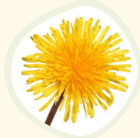
Dandelion ( Taraxacum officinalis )