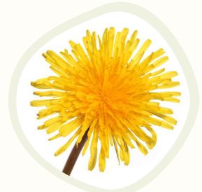
Dandelion ( Taraxacum officinalis )