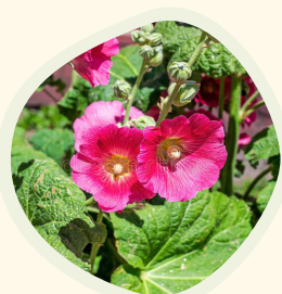
Mallow Rosa ( Malva rosea )