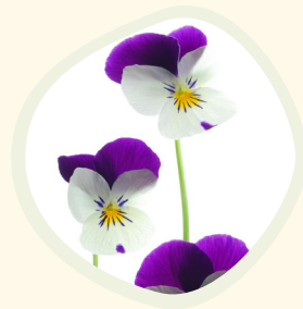
Wild pansy ( Viola tricolor )