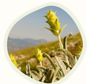
Ironwort ( Sideritis syriaca )