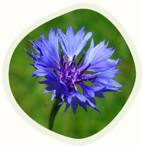
Cornflower ( Centaurea cyanus )