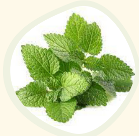
Lemon Balm ( Melisa officinalis )