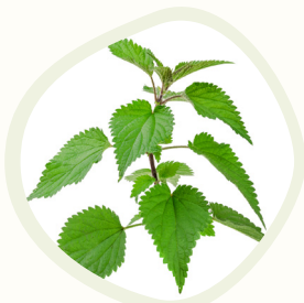
Nettle ( Urtica dioica )