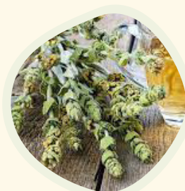
Ironwort ( Sideritis raeseris )