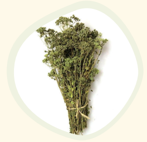
Oregano ( Origanum vulgare )